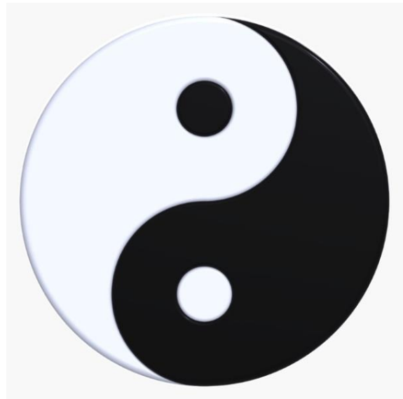
Symbole du Yin-Yang

The SOUL's main objective and purpose in life thereafter will be to awaken to its true nature, to repent and be born again of the Holy Spirit in order to be filled solely with the Holy Spirit and expel all worldly spirit attachments, all darkness.